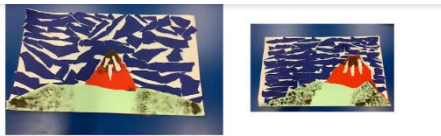
Fuji, Mountains in clear weather - Katsushika Hokusai