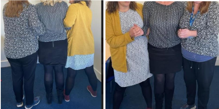
Reference: Double cup hold 5