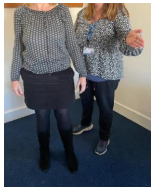
Reference: Prompting 2