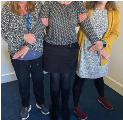
Reference: Straight arm immobilisation 6