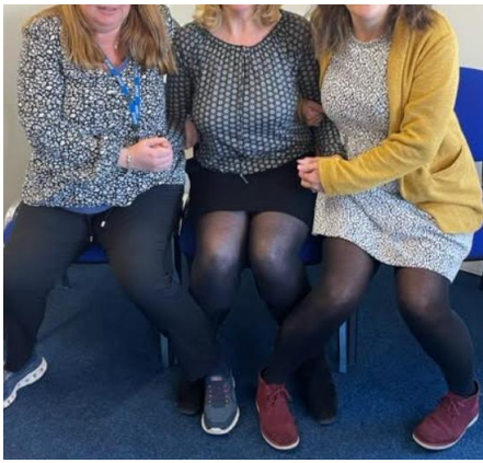
Reference: Seated kicking position 8