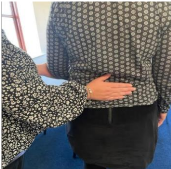
Reference: Guiding 3