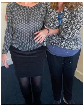
Reference: Escort 4